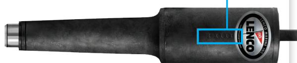
Your existing actuator

Location of the imprinted branding code [ xxxxx ] or [ x_xxxx ]