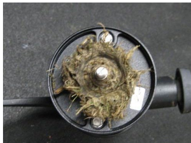
FIGURE 3 (Weeds caught behind propeller)