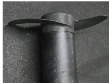
FIGURE 2 (Lower unit and prop with debris)