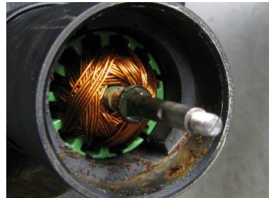
FIGURE 4 (Water damage to the lower unit)

FOR MORE INFORMATION ON TROLLING MOTORS AND ACCESSORIES VISIT MINNKOTAMOTORS.COM