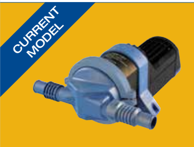
AK2050 Pump head assembly

BP2052(B) (12V d.c. version), BP2054(B) (24V d.c. version)