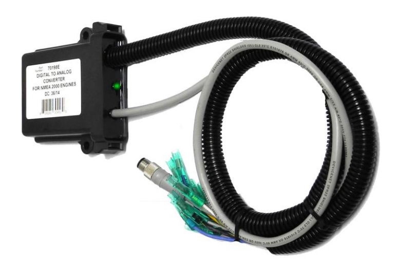
DAC Kit Part #70198E