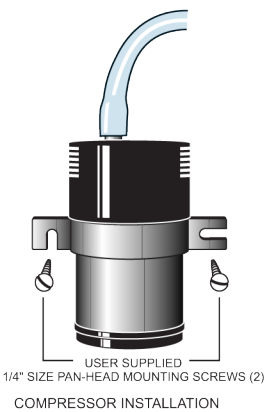
WITH MOUNTING STRAP